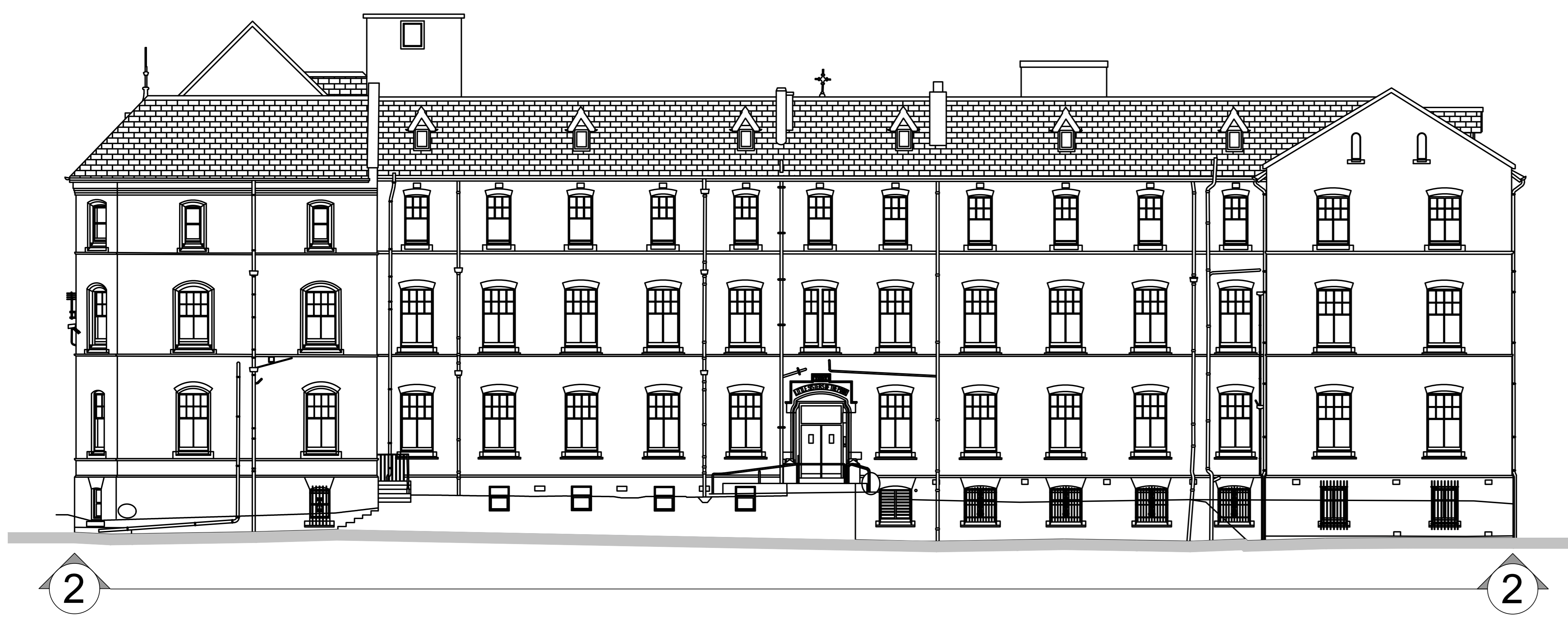
Elevation 2 - Existing South Elevation of the 'Little Sisters of the Poor' @ 1:100