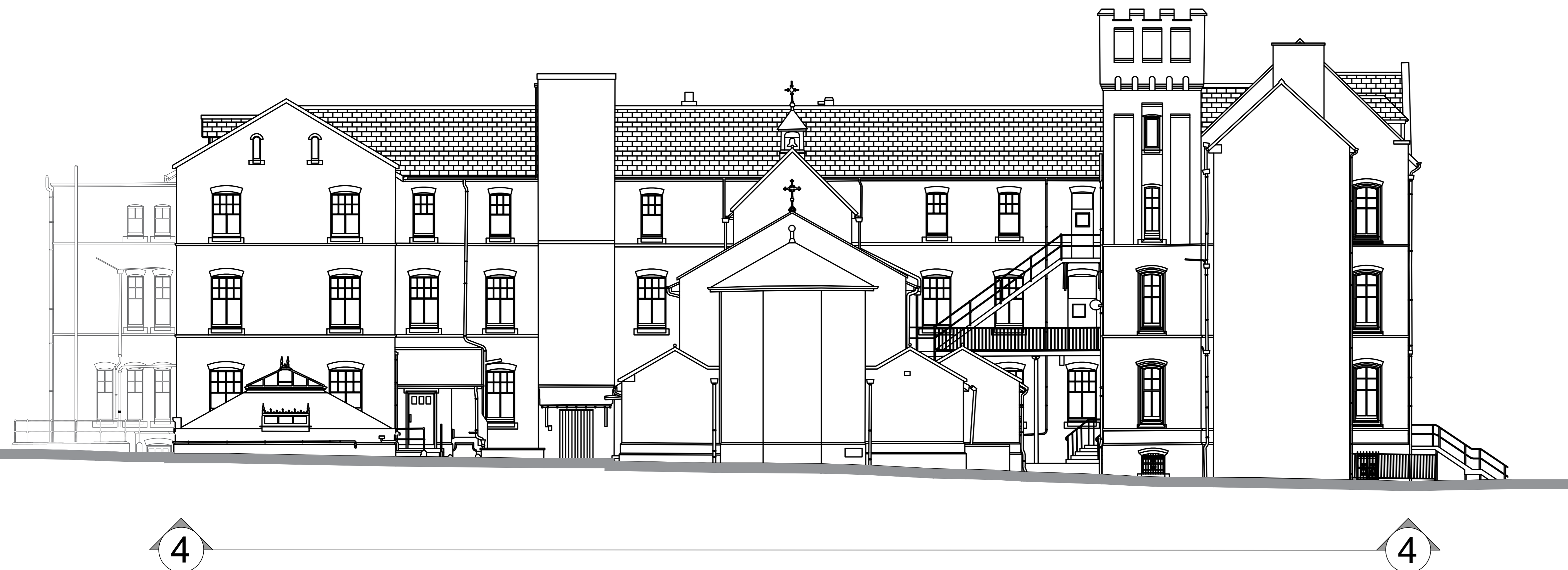
Elevation 4 - Existing North Elevation of the 'Little Sisters of the Poor' including part of Block A @ 1:100