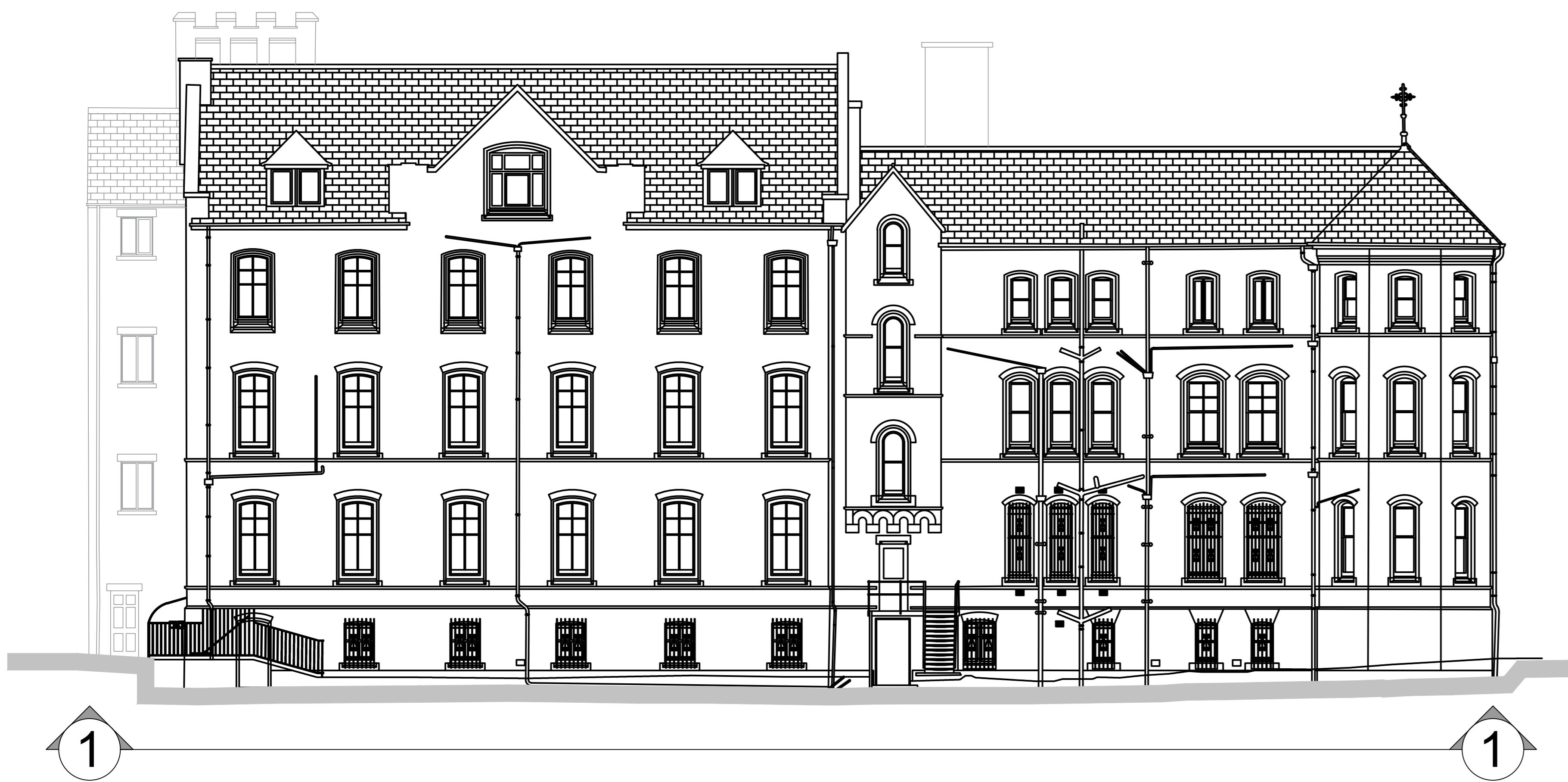
Elevation 1 - Existing West Elevation of the 'Little Sisters of the Poor' @ 1:100

Health & Safety Notes 1. Contractor must ensure that all work on site is carried out in a safe & satisfactory manner, in accordance with Health & Safety Act Work Act 1974, COSHH Regulations 2002 & requirements of C.D.M.