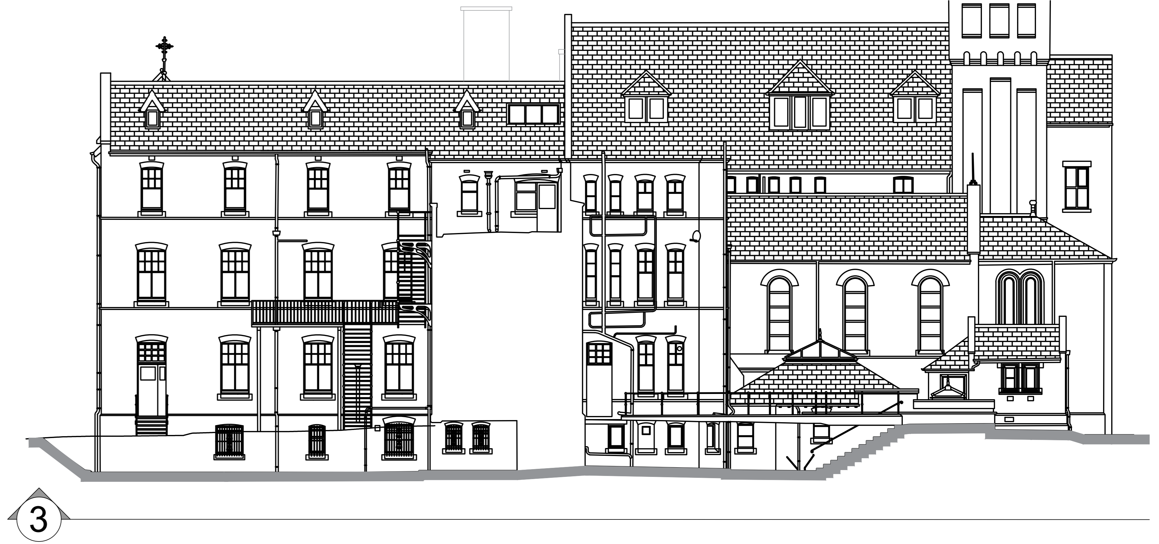
Elevation 3 - Proposed South Elevation of the 'Little Sisters of the Poor' @ 1:100