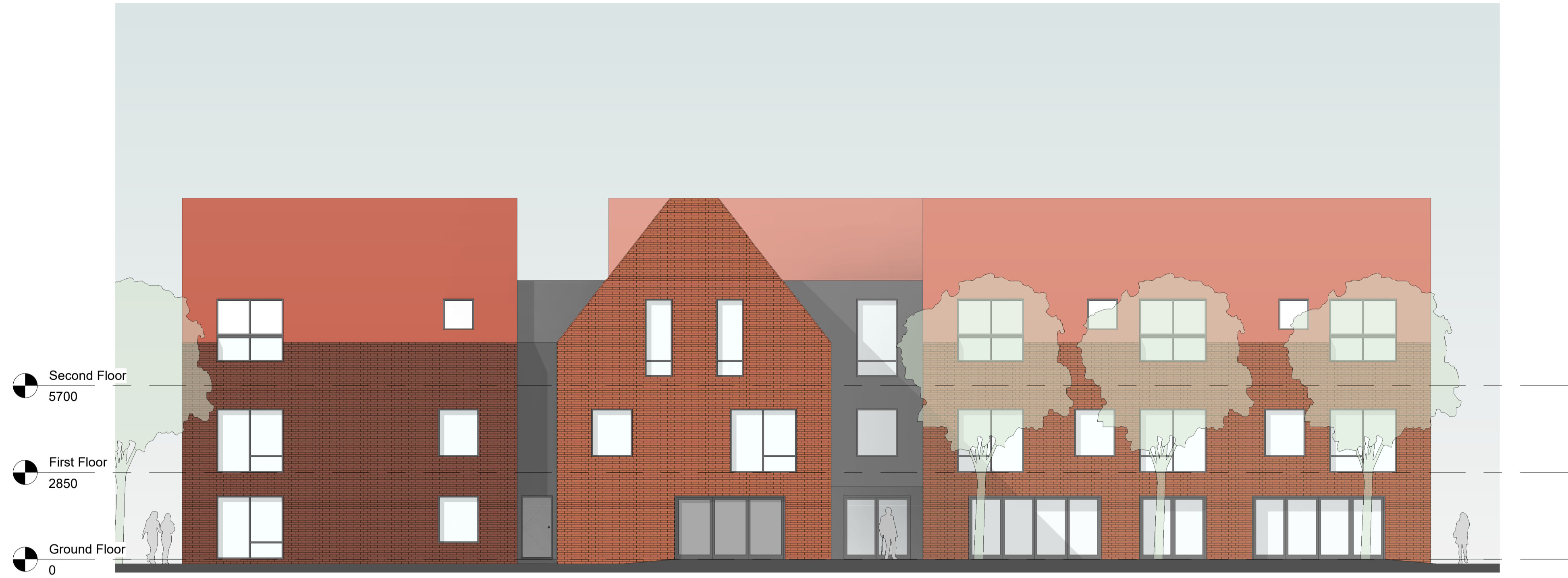
1 South East Elevation 1 : 100