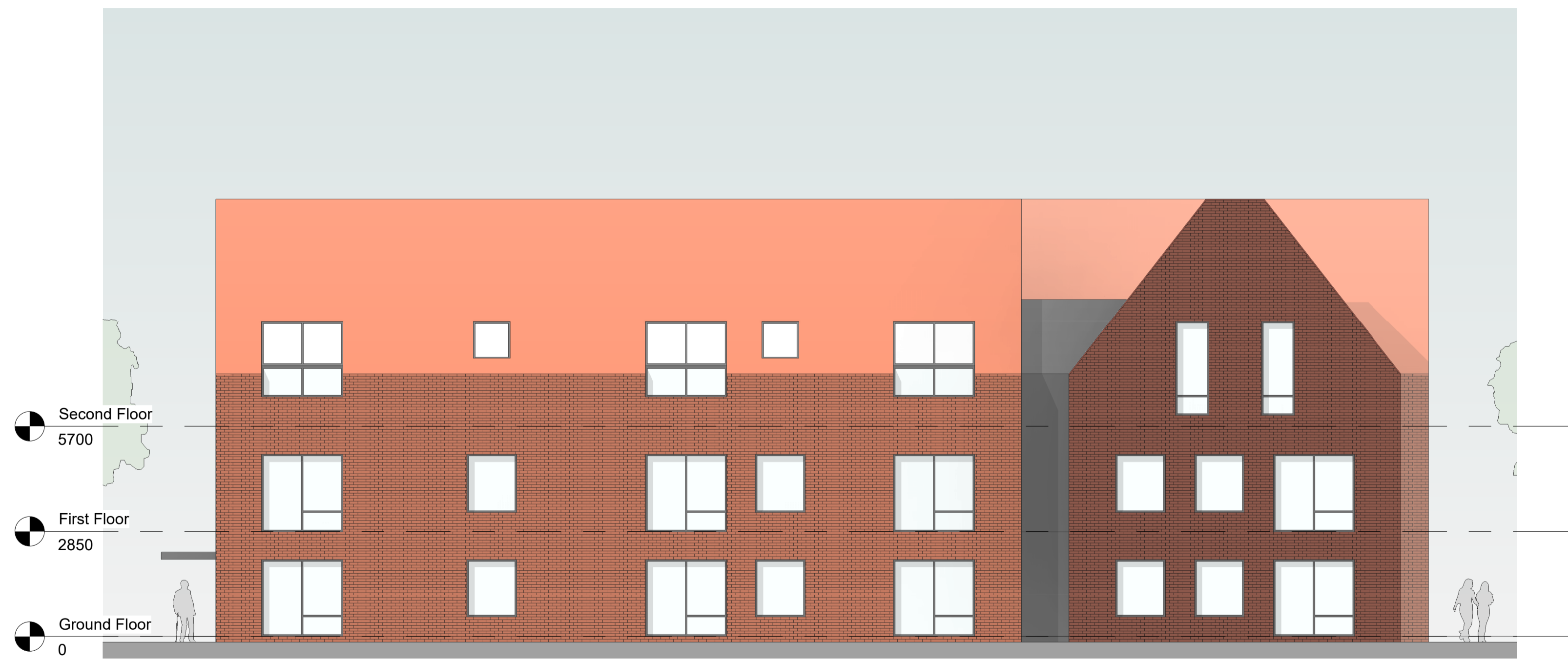
2 Downing Court Elevation 1 : 100