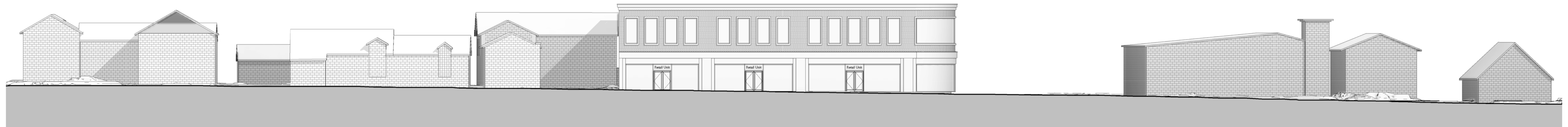
4 Proposed Street View from Garstang Road 1 : 200